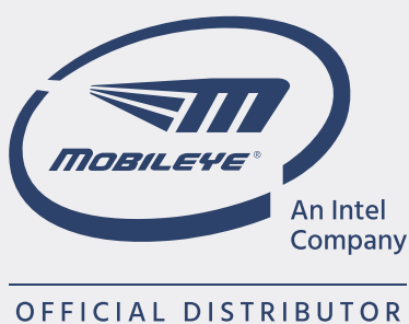
13 Automakers are already working with Mobileye to enable autonomous driving