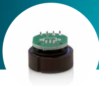
▶ SPS 1000 Z